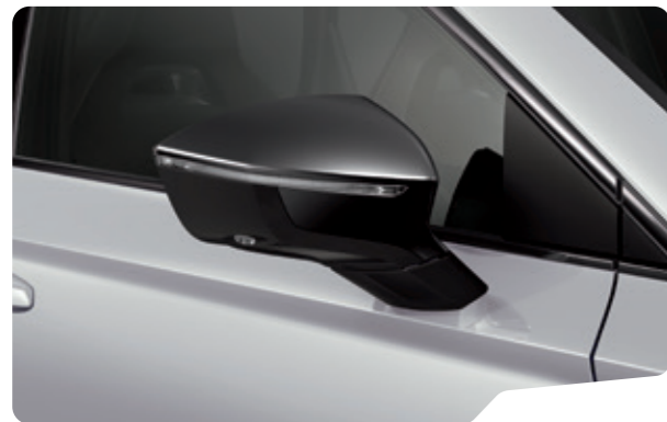
↓ NEVADA WHITE M S