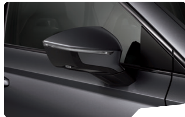
↓ GRAPHITE GREY M S