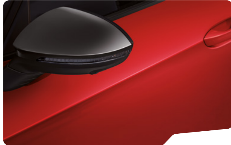
← RAYLEIGH RED 2