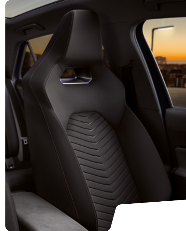
← SEAQUAL® BUCKET SEATS S