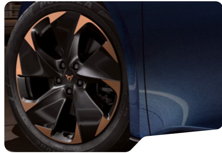
→ 19" COPPER TYPHOON S