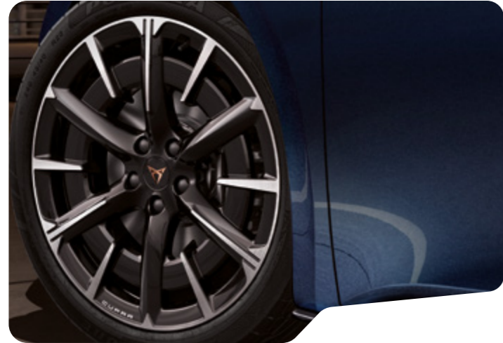
← 20" FIRESTORM O