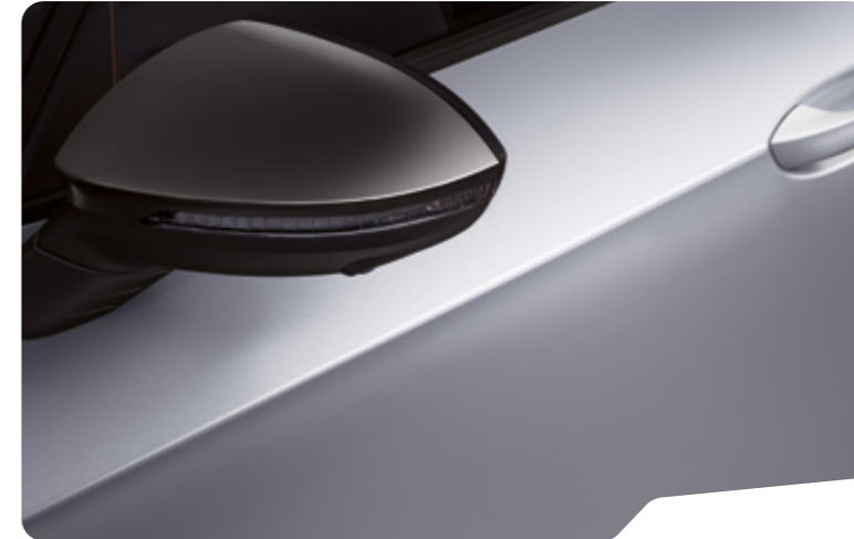
← GLACIAL WHITE 2